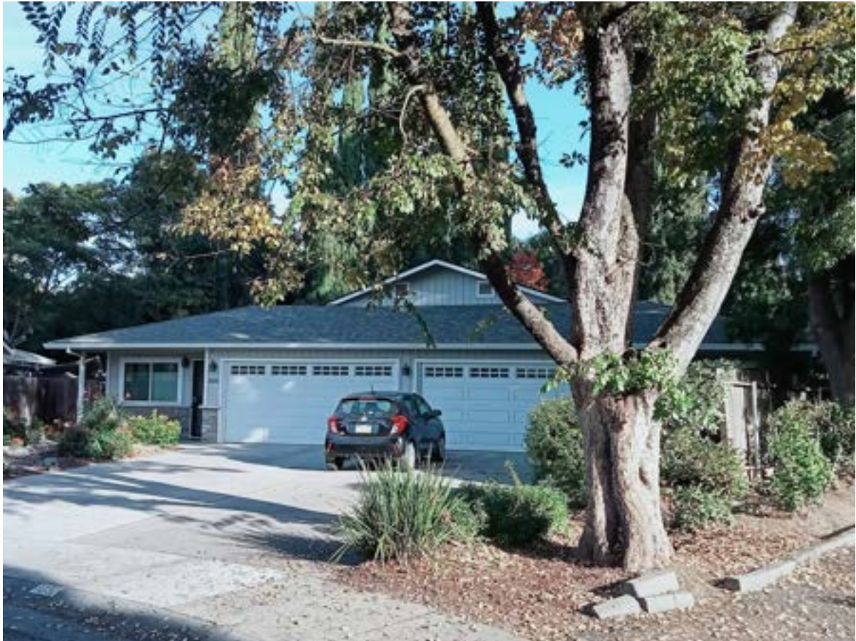
A house rebuilt after burning down