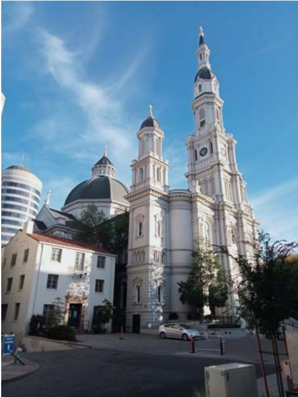
The church at Sacramento