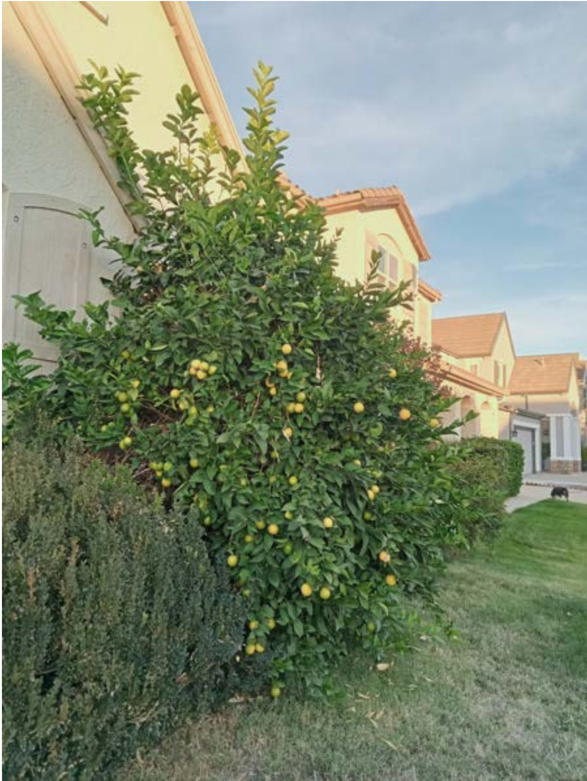
Lime tree outside Roy's house