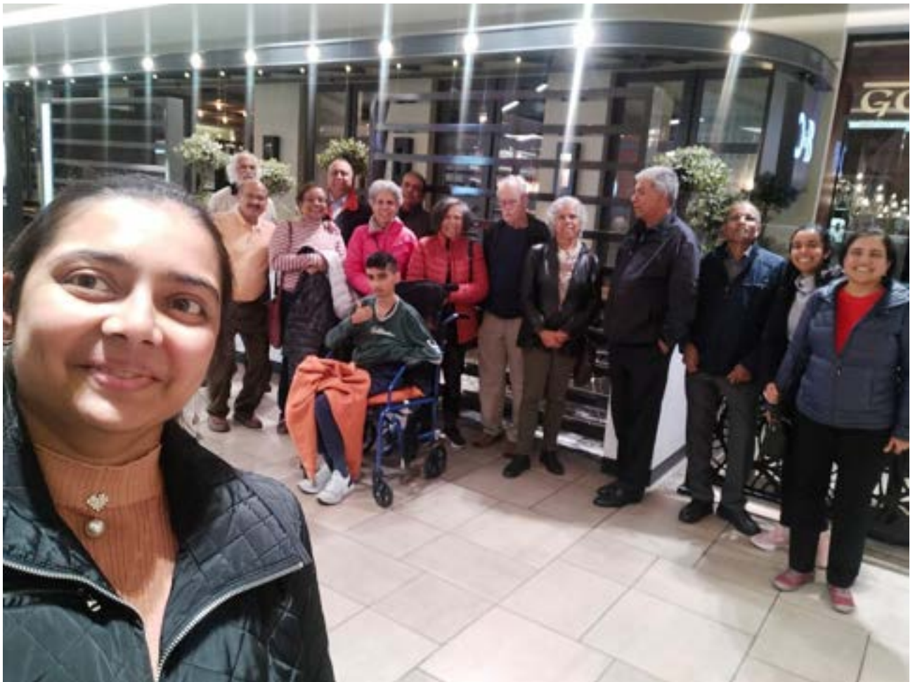
The Great family reunion at Toronto