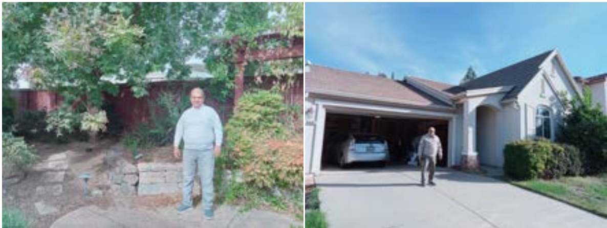
Front and back of Roy's house