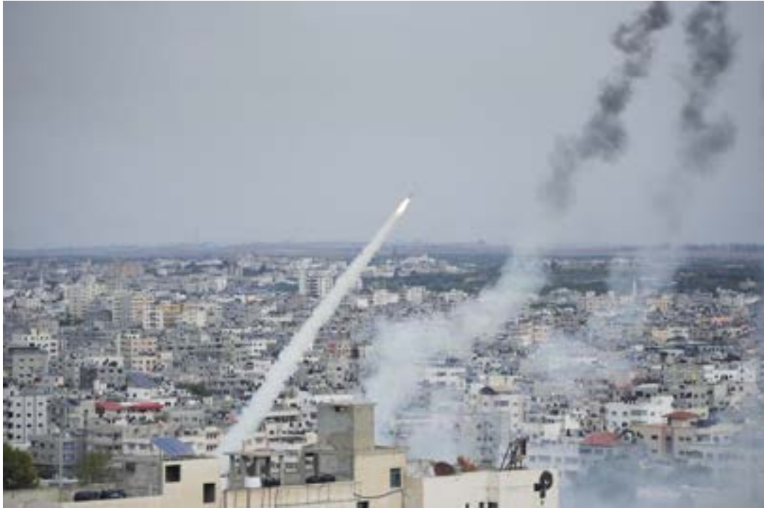
The Isreal Palestine conflict at Gaza