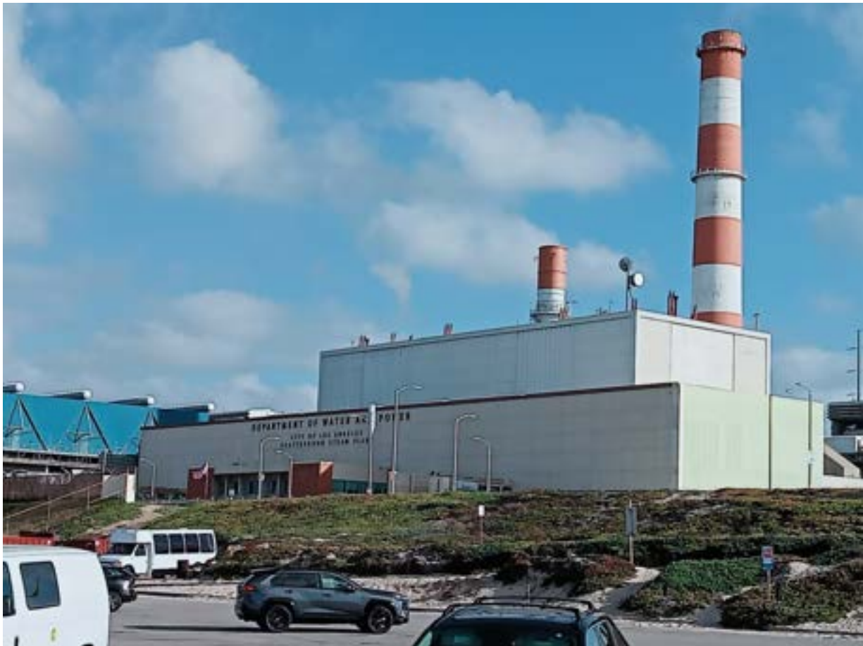
Water treatment facility at Los Angeles