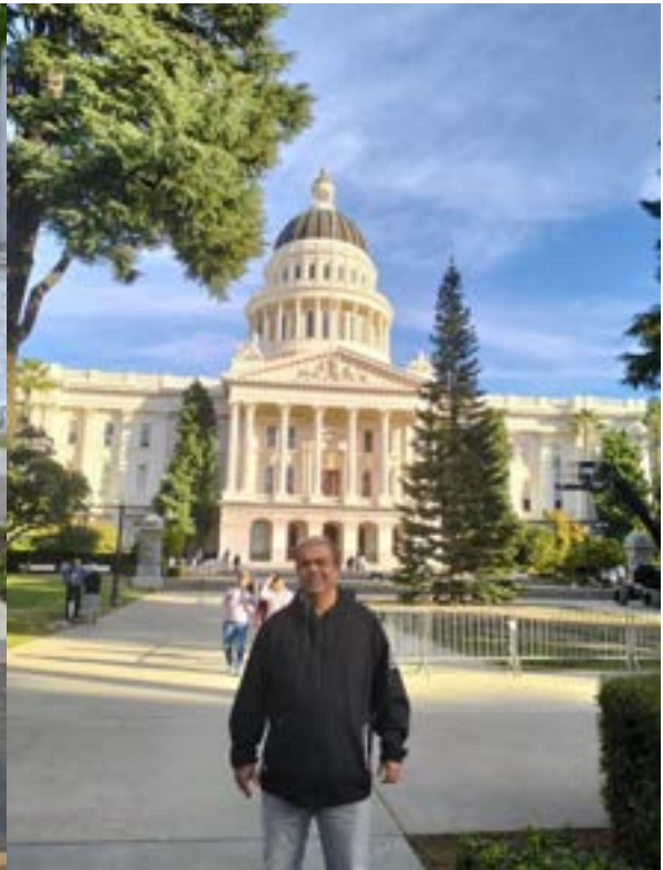
Sacramento War memorial and Secretariat