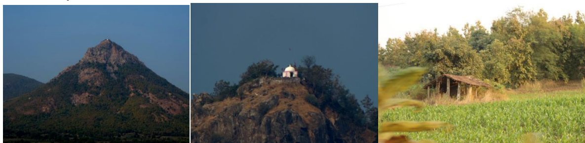
Fenai Mata Rewakahnd