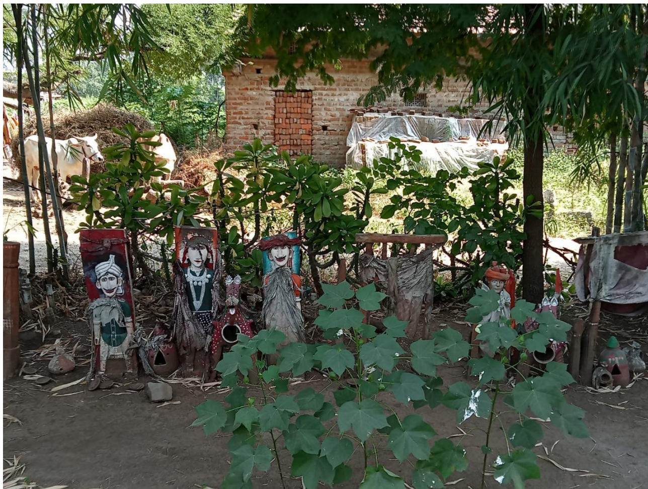
Ancestral and Nature worship the hallmark of Adivasi Spirituality and related cultural underpinnings