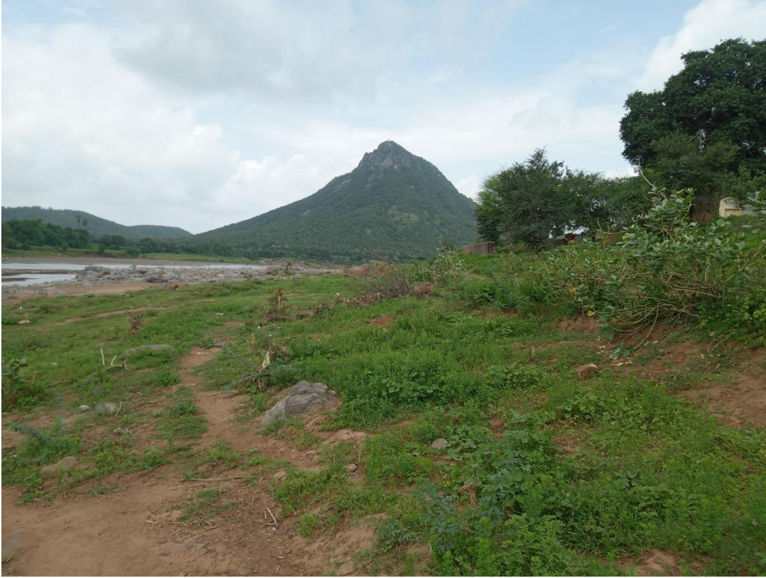
Fenai Mata Region

We, the tribal people of Fenai-Rewakhand region, culturally living with our forests, water, land and biodiversity for centuries. Our agriculture, animal rearing, health-medicines, culture, traditions, customs and all socio-economic practices are dependent on our forests. Due to the Sacred Circumbulation of Mother Narmada, this region is ecologically-culturally and socially very important. We have always been protecting our natural & cultural heritage and will continue to do so. Jungle-water-land and biodiversity are the basis of life for Adivasi. That is why we will use all the provisions of law to elicit cooperation from the government and society in order to withstand all challenges and threats. Today we, the residents of Fenai-Rewakhand Jaiv Shrishti Mandal pledge to protect and preserve our natural heritage and in order to do so we will imbibe all necessary values and culture. We very well understand that rights emerge from responsibility therefore, we will use the FRA 2006 and constitute environmental committees in all villages and through community forest responsibility and community forest rights, we will protect the forests of Fenaimata, Ronjiyadeo, Bhandandeo and Ranikajalmata.