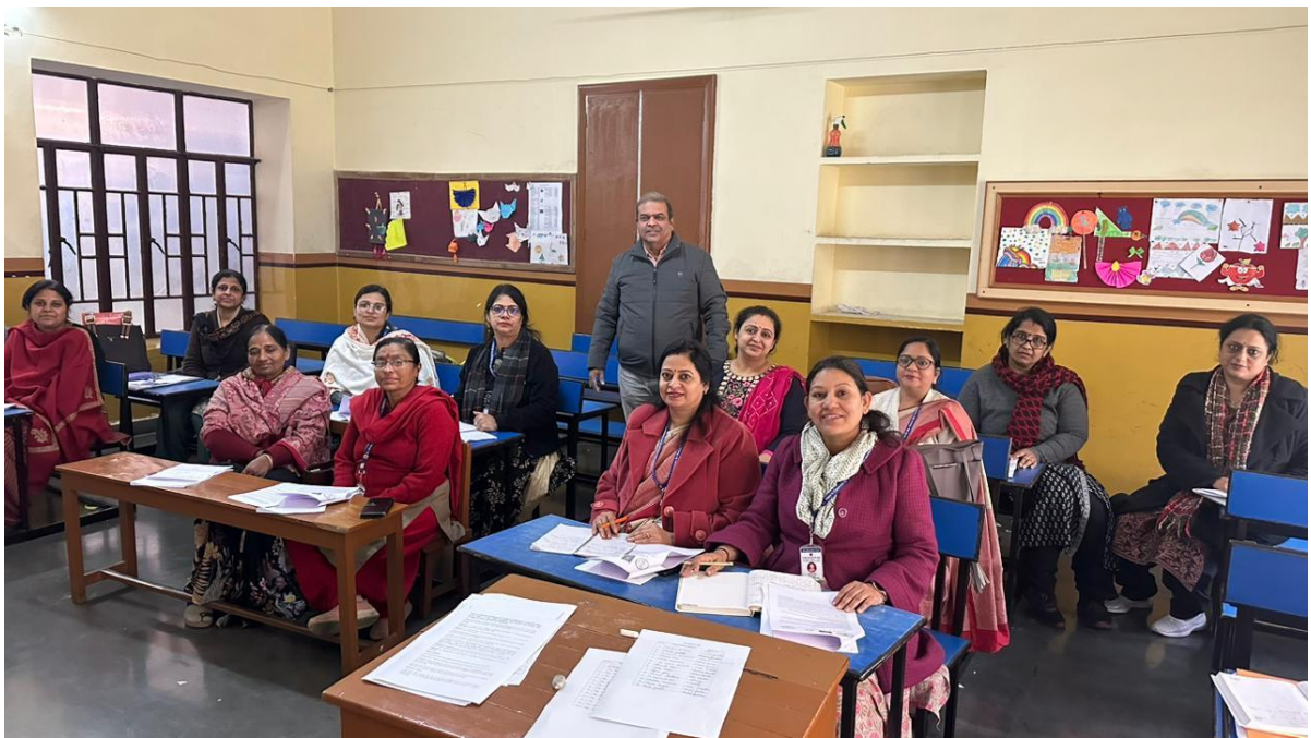
SMA meeting on 20th January 2024