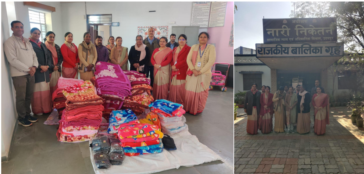
SMA contribution to Nari Niketan

Given the paucity of time, the reports submitted earlier were considered as completed apart from the two reports provided under Annexure 1 and 2 below, the visit to Nari Kendra, engagement with Vidyarthi Parishad were shared. The detailed reports are available with SMA Fatehpura.