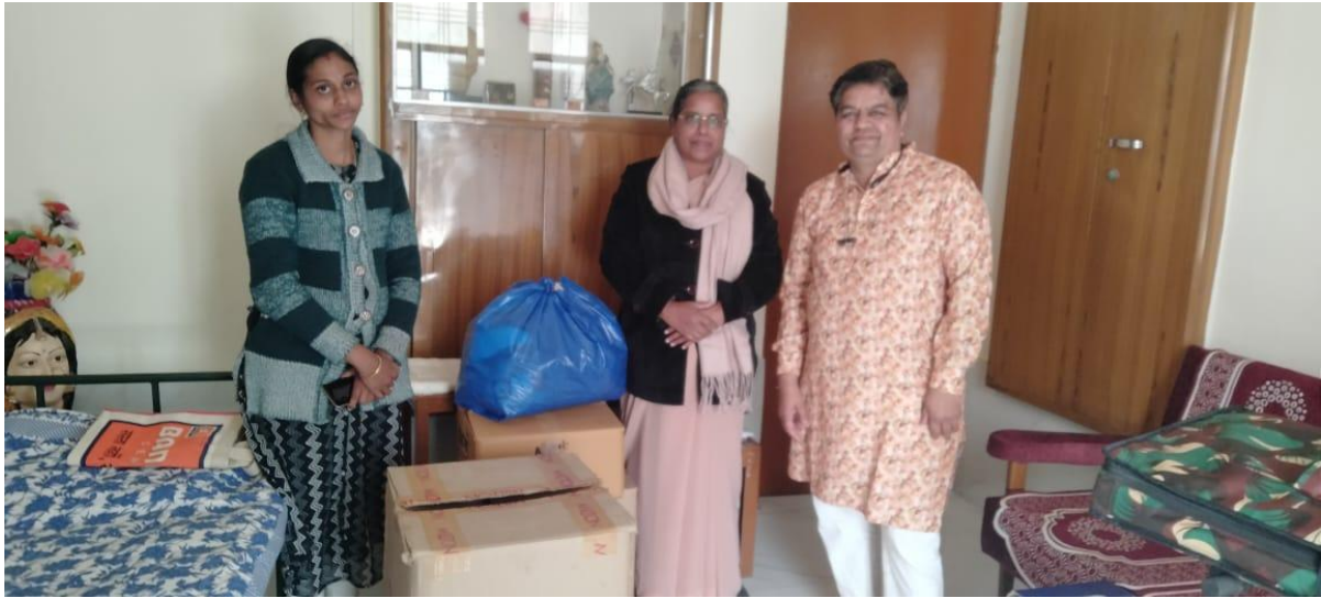
SMA Contribution to Vidyarthi Kalyan Sanstha