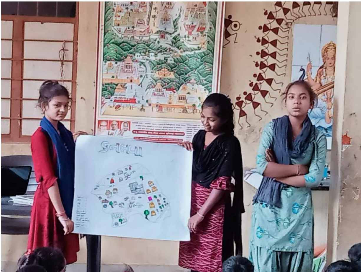
Ecological map of Kanalva prepared by the children of the village in Adivasi Jan Utthan Trust hostel, Bhekadiya