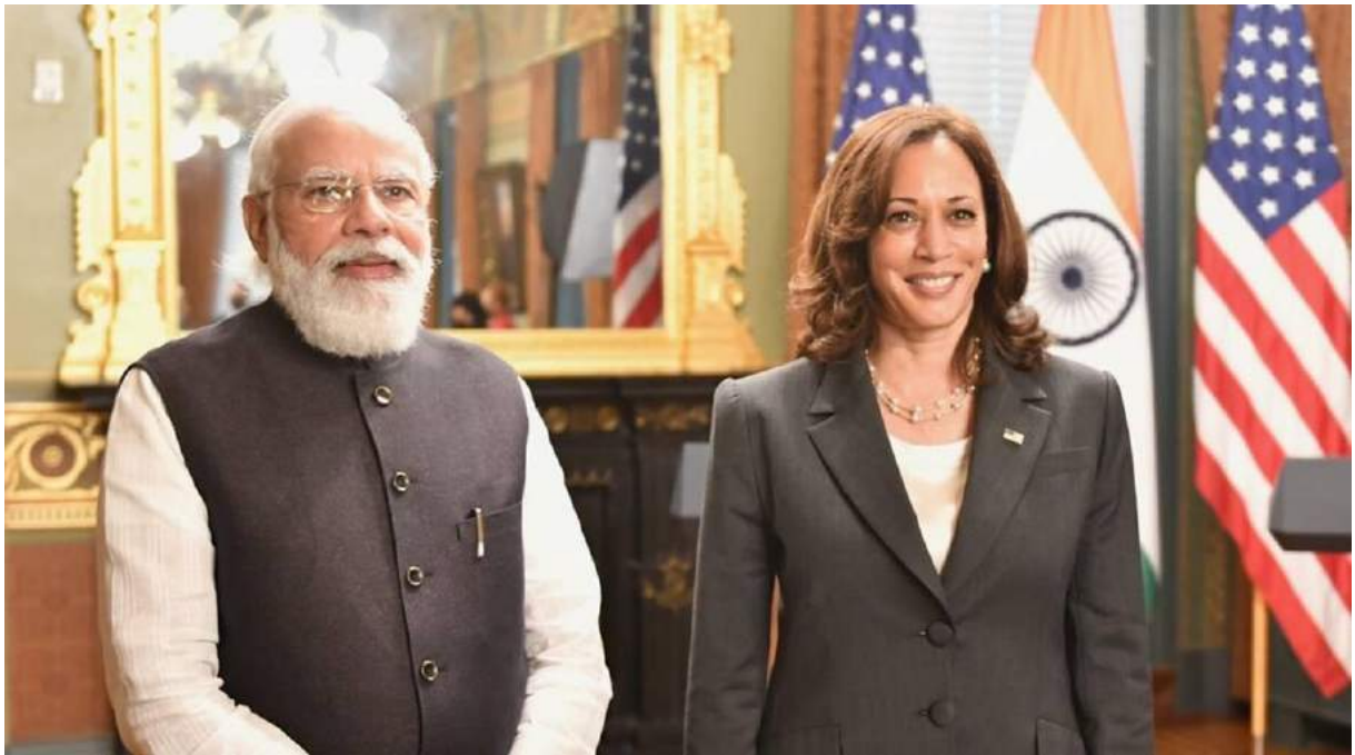
East meets West: Poles apart - The MIC connection ?