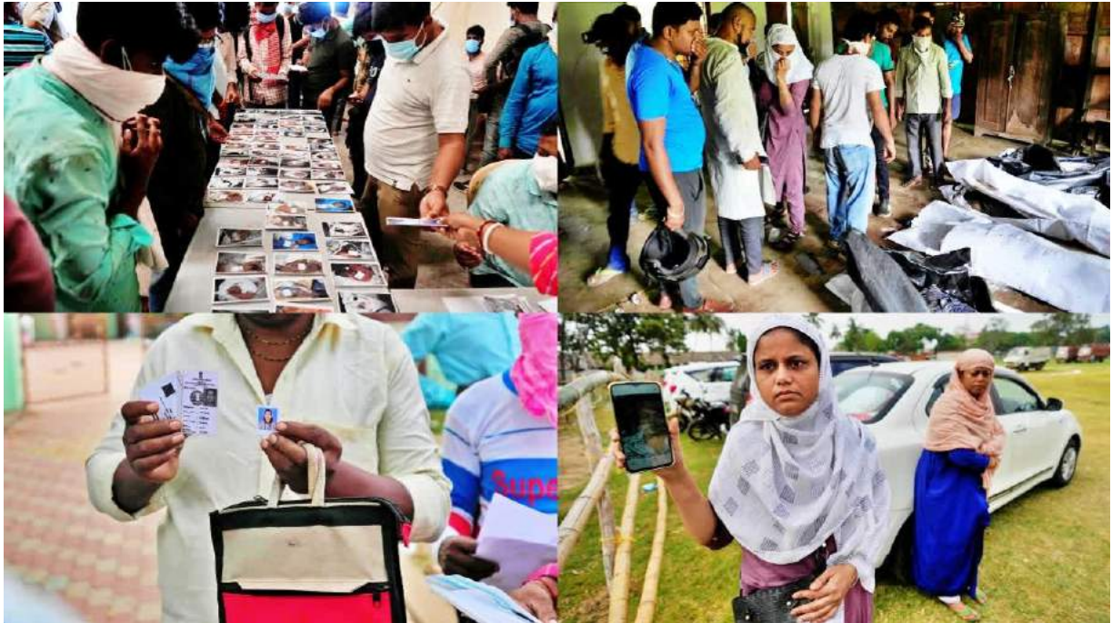
Unidentified bodies after Odisha train crash

https://www.etvbharat.com/english/state/odisha/death-toll-revised-to-275-187-bodies-yet-to-be-identified-odisha-govt/na20230604163950098098682