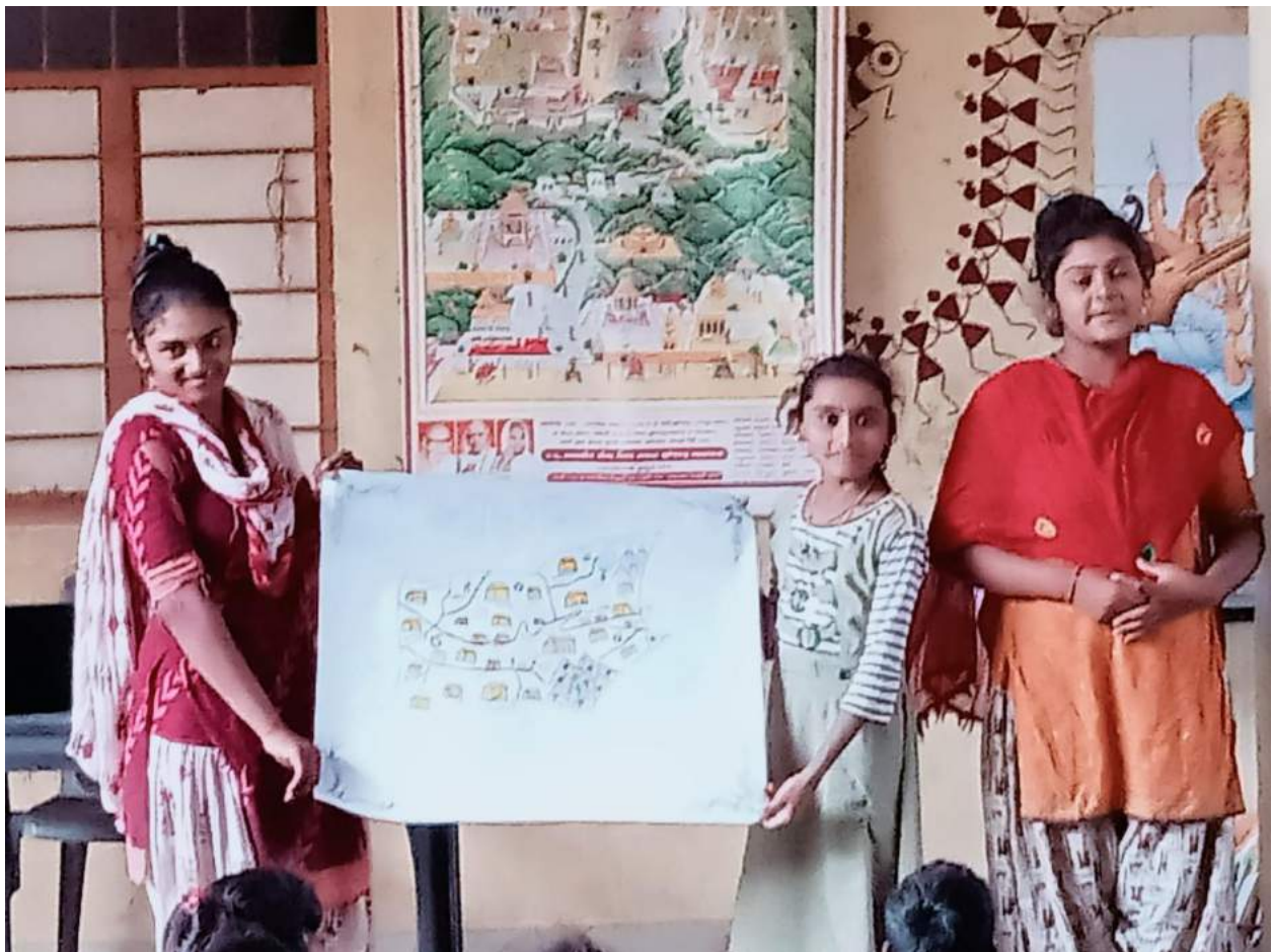
Ecological map prepared by children of Mandka at programme in Adivasi Jan Utthan Trust, Bhekadiya

This programme will be followed up by regular monthly programmes that will help children detail the natural resources and social wealth within their village. Once the children are more confident and articulate about their issues, how this can be reported and mapped using google earth will be explored under the programme which is providing computer education to the children. The programme for providing children of the Ashram with local food once a month will be dovetailed with this and an attempt will be made to see how this can help develop an action research programme for the 355 children in the Ashram coming from about 50 villages. In the meantime AAJ will profile the children and also store the documentation village wise in the library so that over time village wise dossiers can be made and assist the women's groups in micro planning for the village based on the local biodiversity.