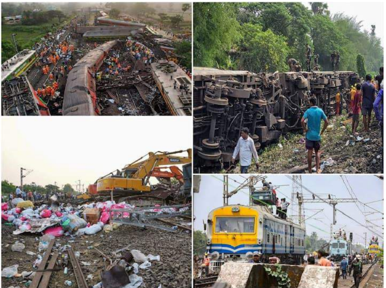
Balasore Train Crash