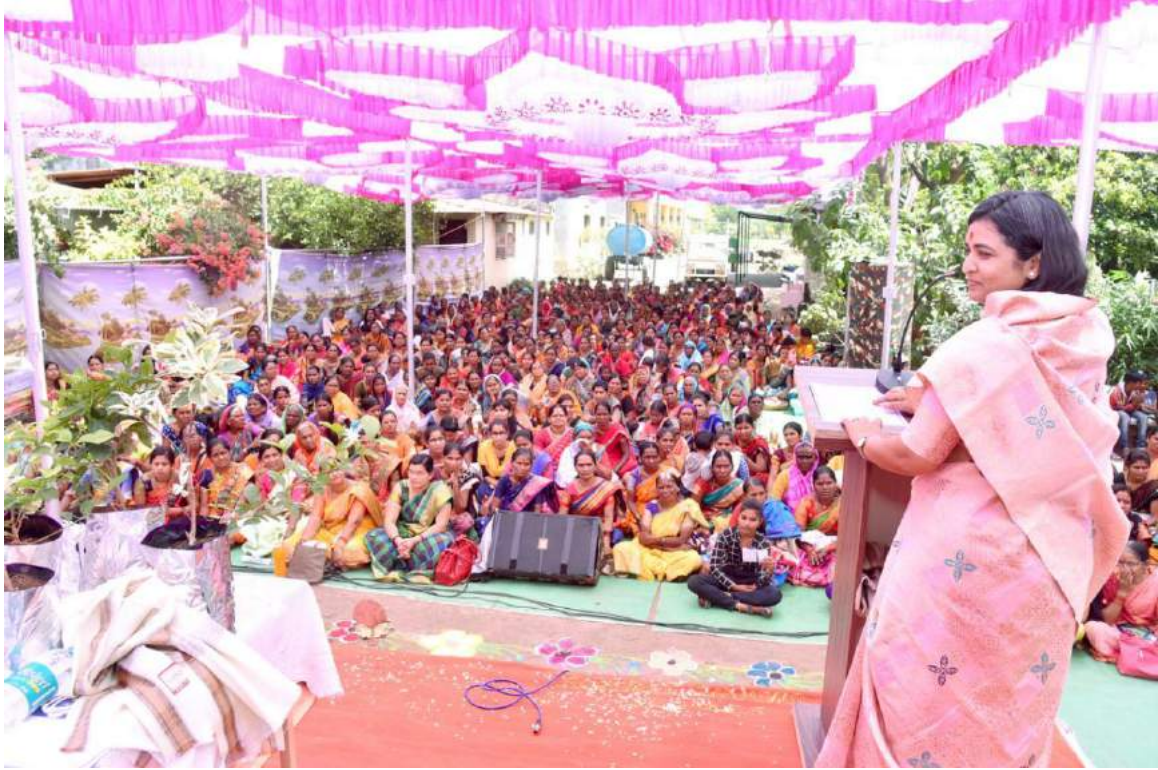
Women's day at Ashankur