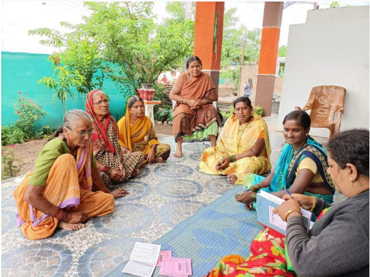
Self Help Group - The First Stage in women's empowerment

Ashankur's work related to three verticals were examined namely Women's empowerment through SHGs, Remedial classes for children from classes 1-4 and Skill Development in tailoring, nursing and computers. The participants were divided into three groups covering each vertical and presented their understanding to the two other groups who had been given the task of identifying the SDGs contained in the presentation of the group ( See Annexure 1 for the details put forward in the presentations).