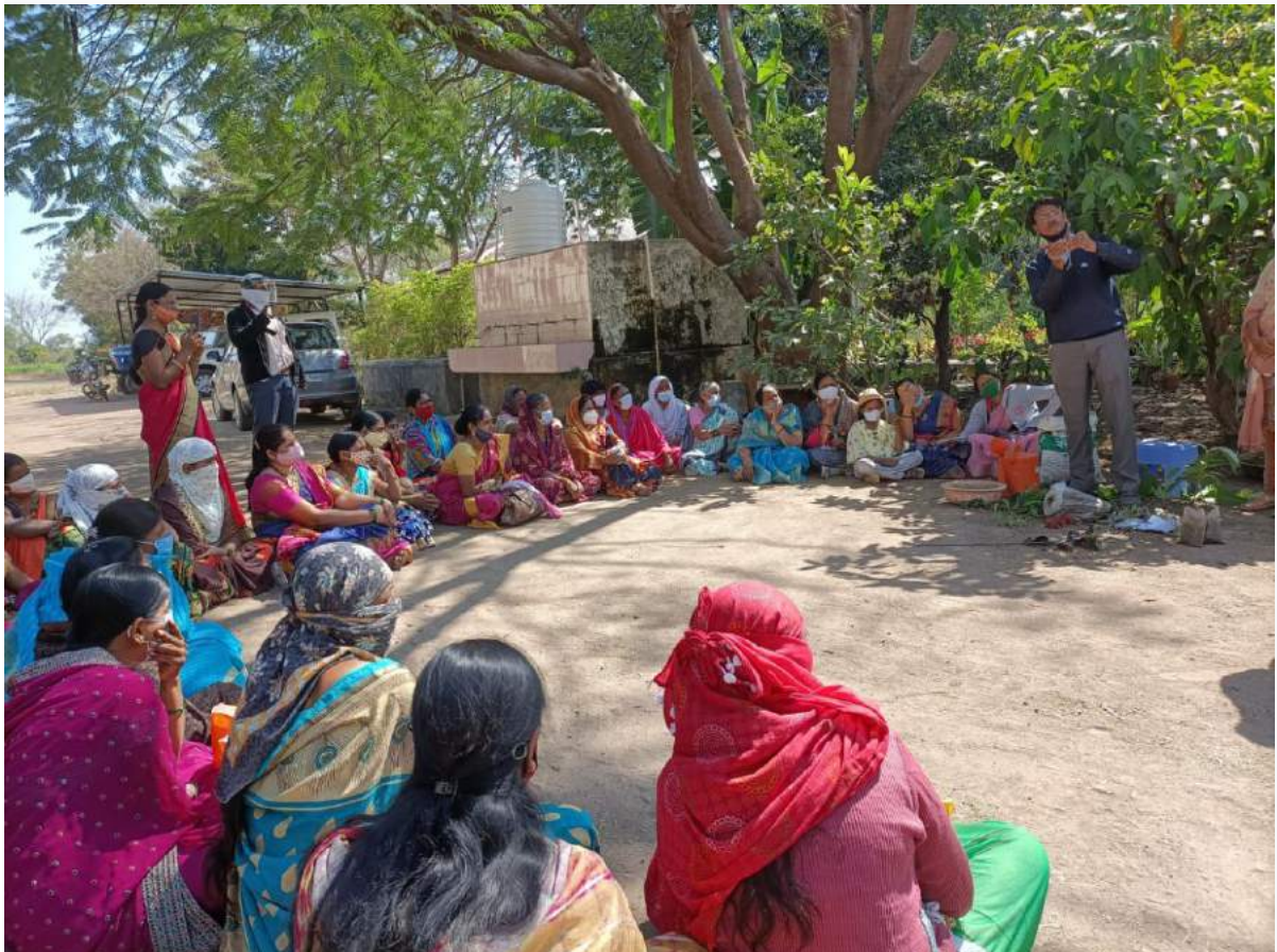
Training on Nursery Raising

It was suggested that the government programmes could be the starting not ending point and used to engage meaningfully on women's issues in the present while opening up avenues to address more complex issues in the future (Refer Annexure 2).